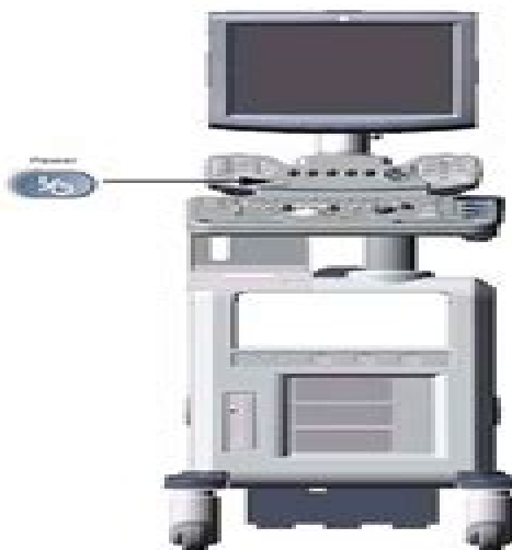
Figure 3-9 Power On/Off Switch Location