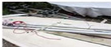
Mast in two sections: