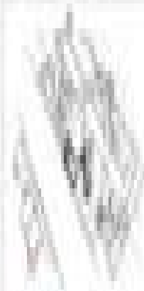
Front view of the car