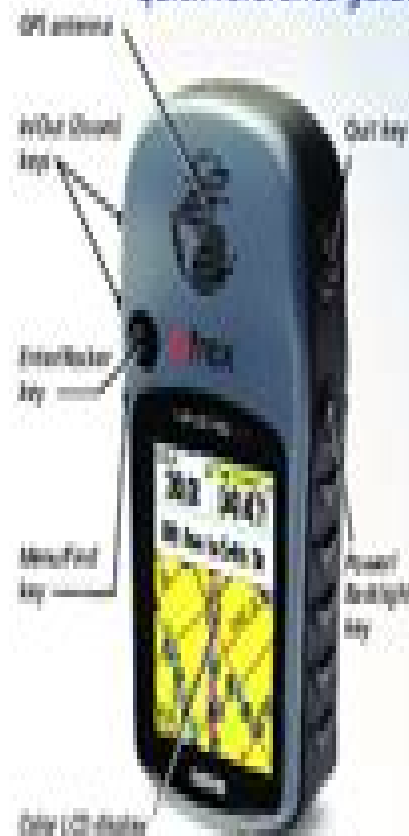
or the Legend shown