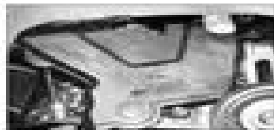
■ ■ ■