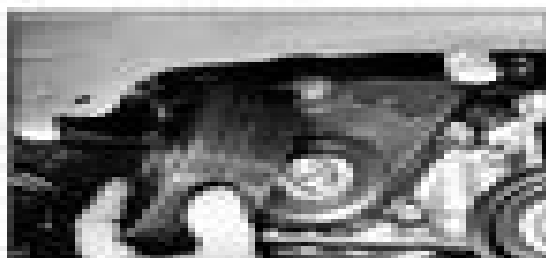
© 1998 Macromilling Corporation. All rights reserved.