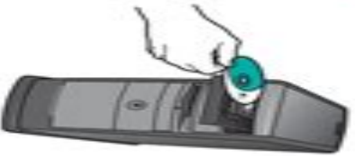
Figura 1 Verifica che la pila sia inserita nel vano batterie. Figura 2 Assicurati che la pila sia inserita nel vano batterie nel modo corretto. Figura 3 Premi il tasto di accensione per avviare il telecomando.