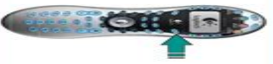
Figura 1 Verifica che la pila sia inserita nel vano batterie. Figura 2 Assicurati che la pila sia inserita nel vano batterie nel modo corretto. Figura 3 Premi il tasto di accensione per avviare il telecomando.