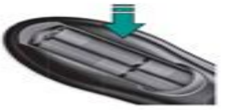
Figura 1 Verifica che la pila sia inserita nel vano batterie. Figura 2 Assicurati che la pila sia inserita nel vano batterie nel modo corretto. Figura 3 Premi il tasto di accensione per avviare il telecomando.