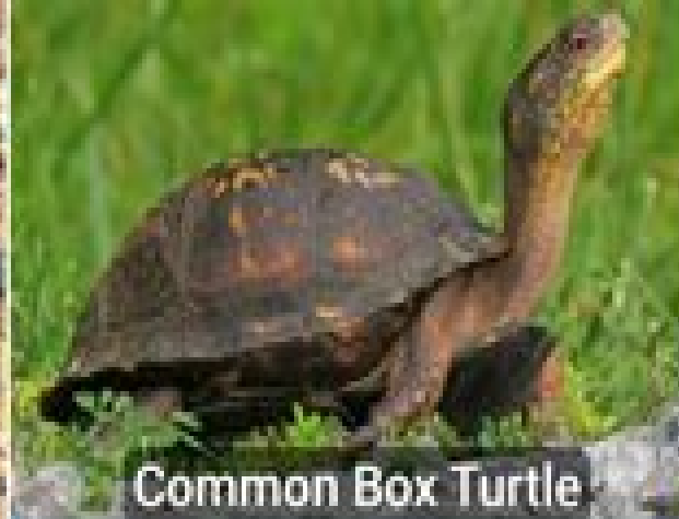
Common Box Turtle