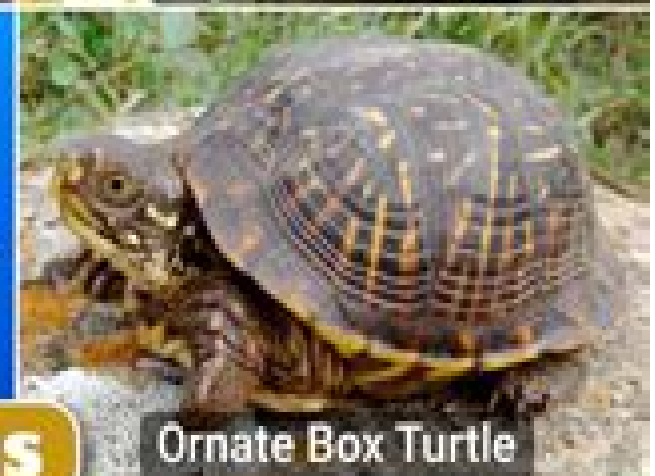
Ornate Box Turtle