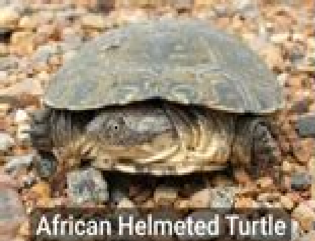
African Helmeted Turtle