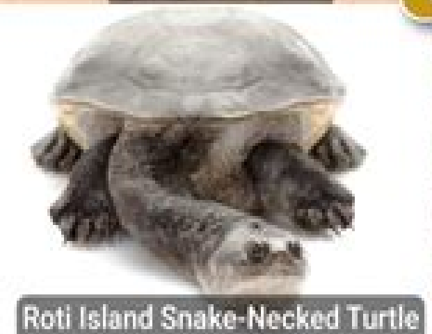
Roti Island Snake-Necked Turtle