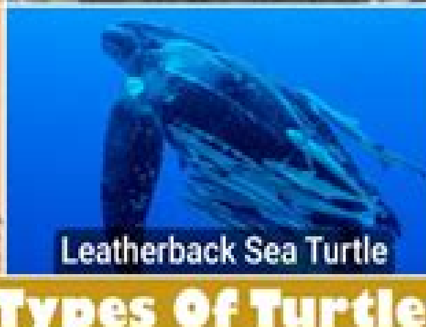
Leatherback Sea Turtle