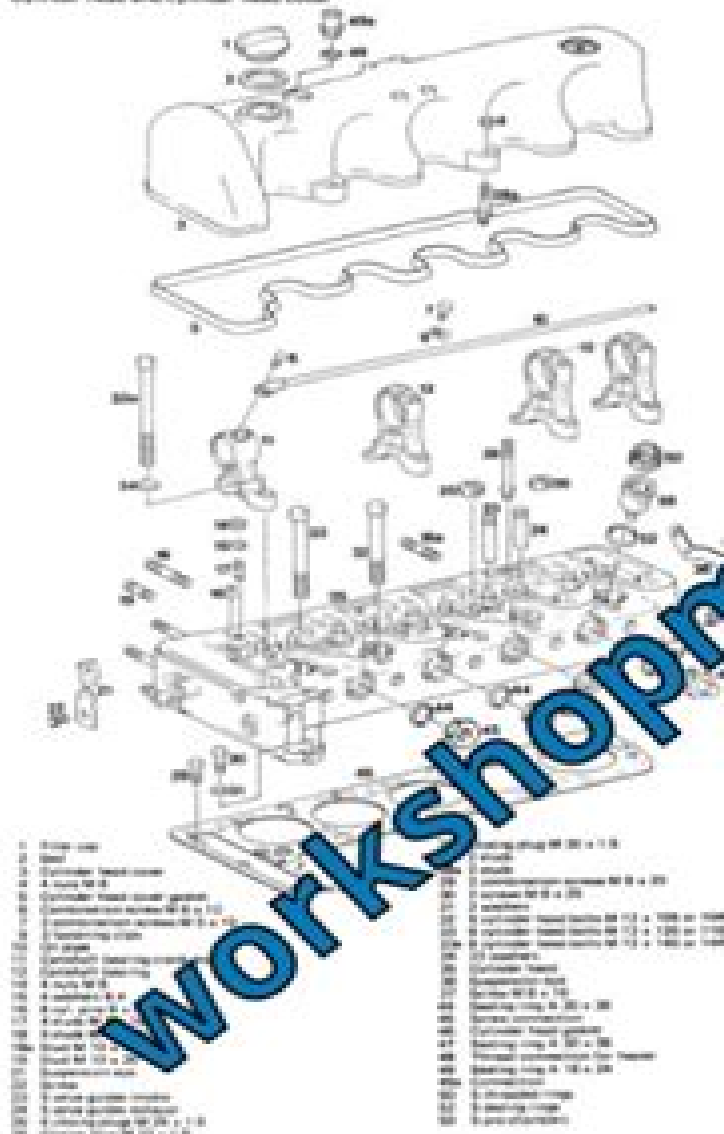
Cylinder head and cylinder head cover

5. When using rigid stage valve guides, press them into the manual thread through base hole in cylinder head.