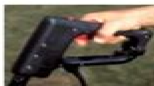
Easy squeeze throttle trigger with 3 speeds