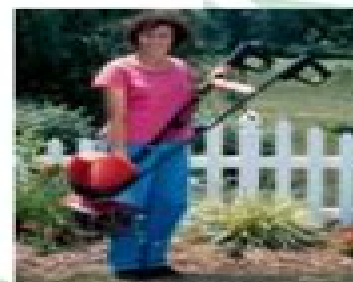
Lightweight! Only 21 lbs!