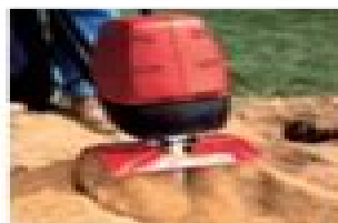
Patented Serpentine Tines spin at up to 240 rpm and can bust through the toughest soil to till down 10" deep. Tines guaranteed for life against breakage.