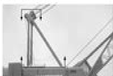
111-06 Boom Support