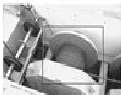
111-11 Boom Support