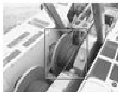
111-09 Boom Support