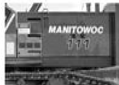
111-12 Boom Support