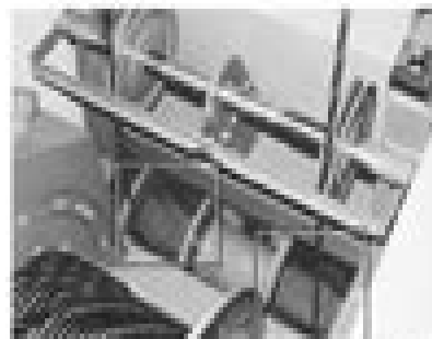
111-07 Boom Support