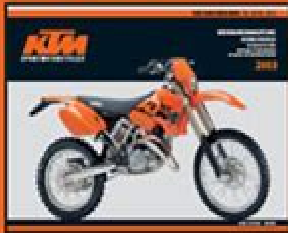
Engine Service Manual