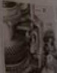
Diagrama de un motor de vehículo.