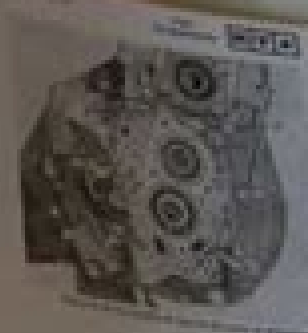
Diagrama de un motor de vehículo.