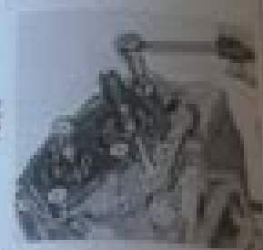
Diagrama de un motor de vehículo.