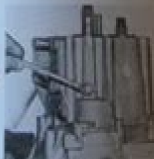
Diagrama de un motor de vehículo.