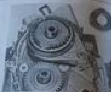
Diagrama de la caja de velocidades de un vehículo.