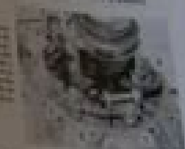
Diagrama de un motor de vehículo.