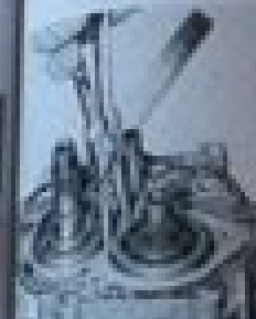
Diagrama de un motor de vehículo.