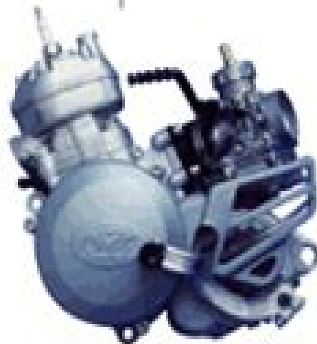
Shock Absorber Manual