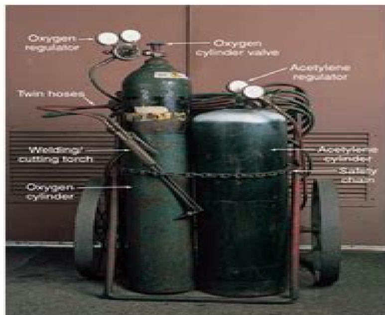
Figure 14-1. Oxyacetylene cutting outfit.

The oxyfuel gas preheating flames are adjusted and used in the same manner as the flames used for welding. The preheating flames are used to heat a spot on the base metal to its ignition temperature. When the ignition temperature is reached, the operator