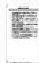
ILLUSTRATION 1: TO VIEW THE MANUALS, CLICK ON PAGE 104 around the display screen which light up when a function is active (for example CD, Radio or Aux.)