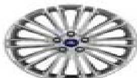
16" Premium Luxury Nickel-Painted Aluminum Optional on SE