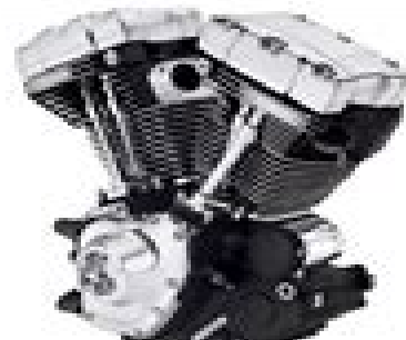
2012 Twin Cam 103 V-Twin 1,690 cc 83 hp