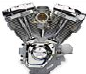
1999-2006 Twin Cam 88 1,450 cc 80 hp