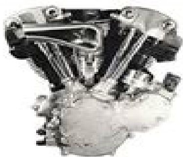
1936-1947 Knucklehead 990 cc & 1,200 cc 40 hp & 45 hp