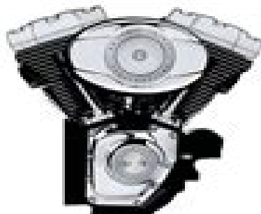
2007 Twin Cam 96 1,584 cc 80 hp