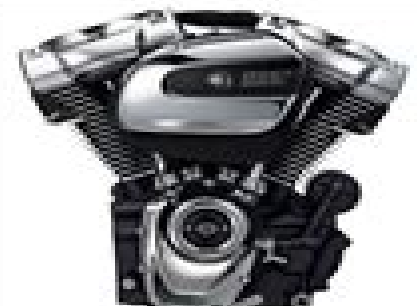
2017 Milwaukee-Eight 107 1,750 cc 92 hp