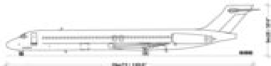
McDonnell Douglas MD87