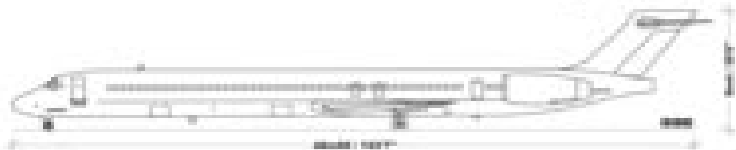
McDonnell Douglas MD90