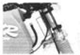
The frame serial number is located on the right side of the steering stem.