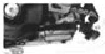
The right side number is located on the back left side of the motorcycle.