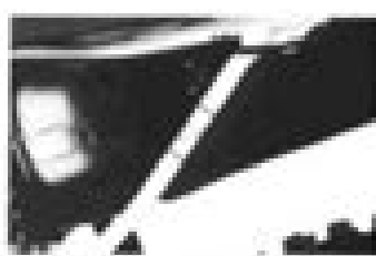
The seat code label is attached to the seat frame side under the seat. When ordering a seat replacement, always specify the appropriate seat code.