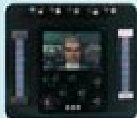
Multi-function video display of visual information for flight control and communications transmitted through the control panel video display screen.

The nerve centre of Thunderbird 1, the craft's cockpit is packed with navigational technology and emergency rescue devices. Like all International Rescue craft and equipment, Thunderbird 1 is continually being modified, and the craft's cockpit has seen a number of upgrades while in operational use.