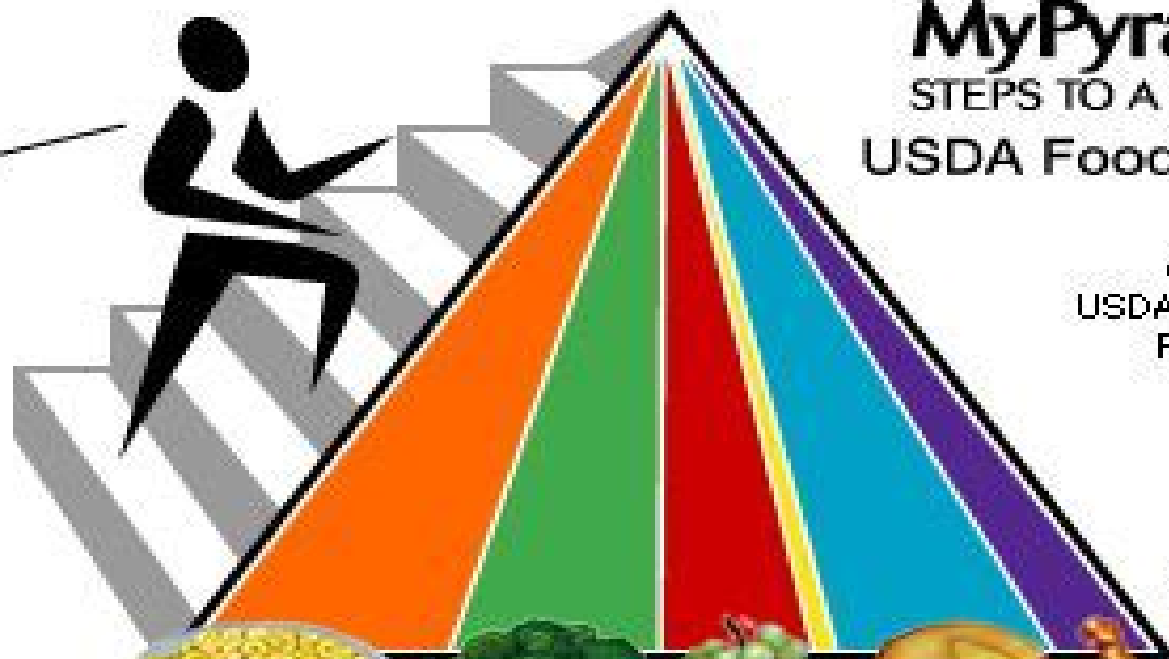
original USDA Food Guide Pyramid

Maintain balance between food and physical activity.