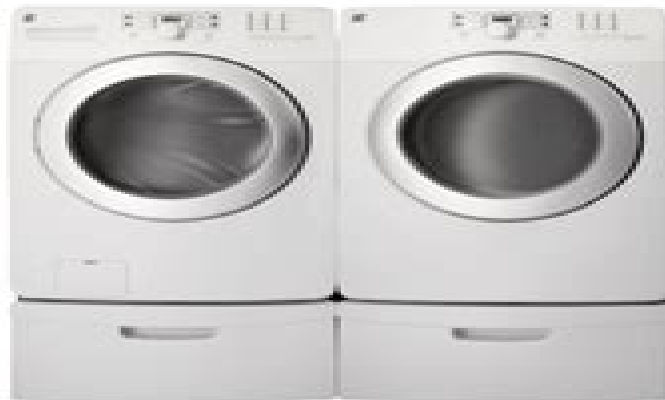
Shown with dryer 26-549032 and optional 15-inch pedestal 26-47252