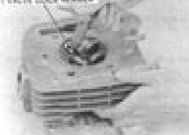
(1) VALVE GUIDE REAMER

If the stem-to-guide clearance exceeds the service limits, determine if a new guide with standard dimensions would bring the clearance within tolerance. If so, replace the guides as necessary and return to 7b.