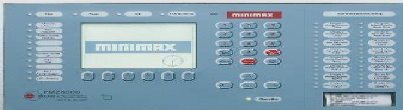
FMZ 5000 Fire detection and extinguishing control panel