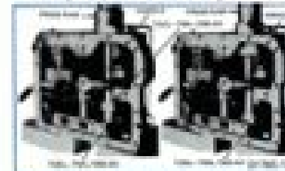
Fig. 43 - Replacing Transmission Case Bearing