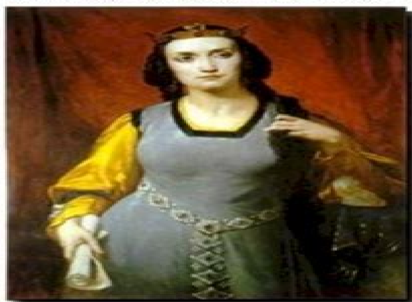
LA DERNIERE ANNEE DE MARIE DORVAL