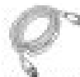
USB Interface Cable

Das Personal Storage-Produkt 3000LS von Maxtor ist abwärtskompatibel und für den Einsatz mit älteren Computersystemen geeignet, die über integrierte USB 1.1-Anschlüsse verfügen. Falls Ihr Computer keine integrierte USB 2.0-Unterstützung besitzt, benötigen Sie eine USB 2.0/PC-Adapter-Carte, um USB 2.0-Datenübertragungen zu erlauben.