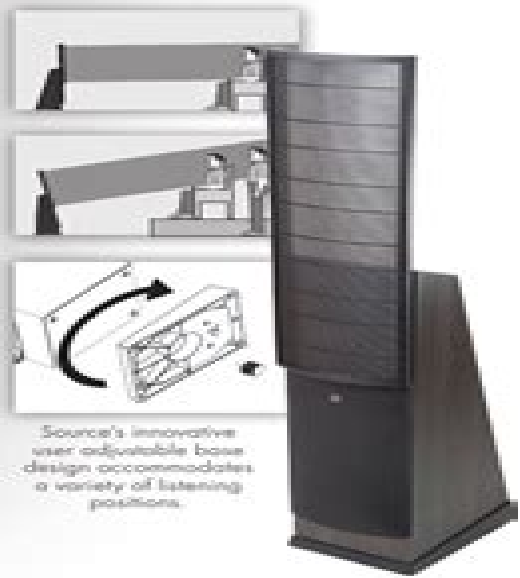
Source's innovative user adjustable base design accommodates a variety of listening positions.

Visit configurator.martinlogan.com to explore the full range of finish options.