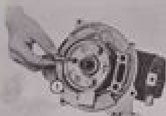
Figure 9 Shoulder Screws & Spring Removal

STEP 40 Remove the 2 Shoulder Screws and Pressure Springs. Then remove the Brake Plate (Fig. 14).