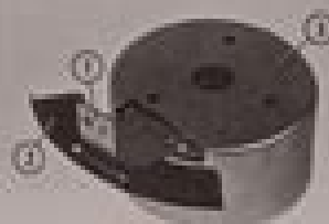
Figure 12 Clutch/Brake Unit Pre-assembly

STEP 43 Pre-assemble the Actuator & Arm into the Clutch/Brake Housing. Then position the Actuator Shaft into the Arm as shown in Fig. 10.