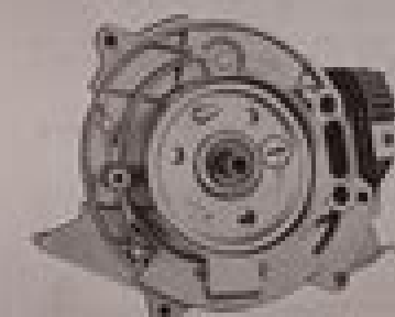
Figure 14 Correct Brake Plate Position

NOTE: Arrow on Brake Plate must point toward exhaust ports (Fig. 14).