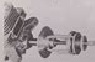
Figure 8 Recommended Roller Assembly

NOTE: If the Clutch/Brake Assembly is installed during assembly with a roller pin and chain as shown in Fig. 10, the roller pin is not required.