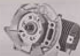
Figure 10 Actuator Bearing Assembly

STEP 41 Remove the Actuator Bearing Assembly (Fig. 10).