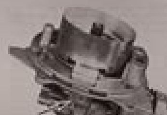
Figure 13 Correct Actuator Arm Location

STEP 45 Install the Actuator Bearing & Retainer Assembly and the Brake Plate.