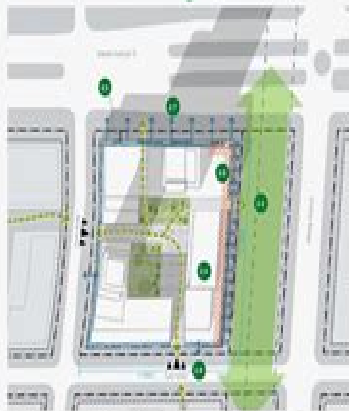
Figure 2 Illustration of framework principles to the block level