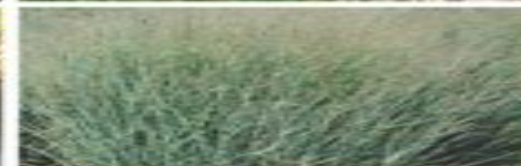
'Dallas Blues' Switch Grass