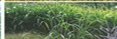
Giant Chinese Silver Grass