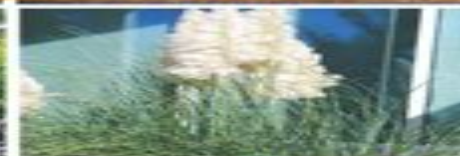
'Pumila' Dwarf Pampas Grass