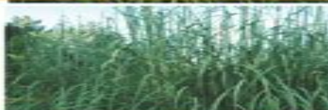
Ravenna Grass Giant Sacaton