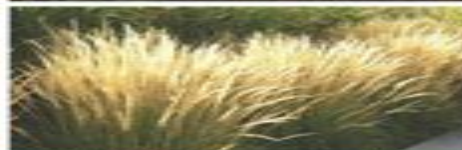
'Karl Foerster' Feather Reed Grass