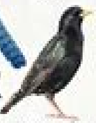
European Starling Sterna vulgaris