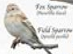
Field Sparrow Spizella pusillus