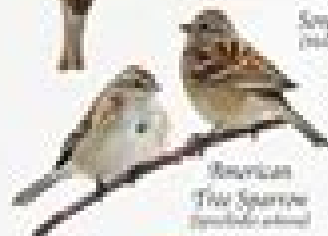
American Tree Sparrow Spizella arborea