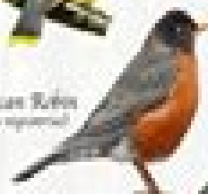
American Robin Merula migratoria