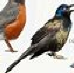
Common Grackle Quiscalus quiscula