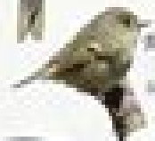
Ruby-crusted Kinglet Corynorhinus ruber