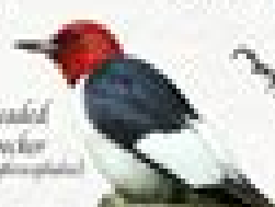
Red-headed Woodpecker Caprimulgus erythrocephalus