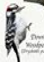
Downy Woodpecker Caprimulgus pubescens