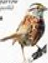
White-throated Sparrow Zonotrichia albicollis