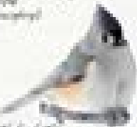
Tufted Titmouse Parus titorius