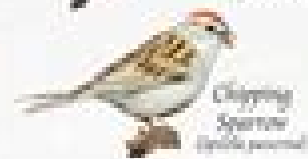
Chipping Sparrow Spizella socialis