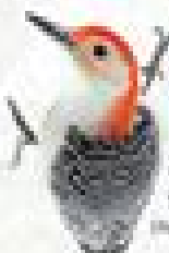
Red-bellied Woodpecker Caprimulgus americanus