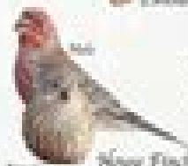
House Finch Monticola montana