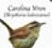
Carolina Wren Troglodytes carolinensis