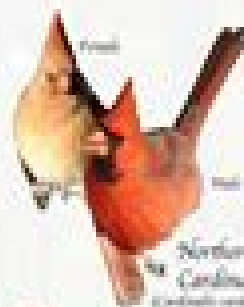
Northern Cardinal Cardinalis cardinalis