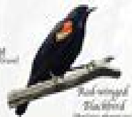
Red-winged Blackbird Agelaius phoeniceus