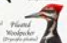
Pileated Woodpecker Caprimulgus pileatus