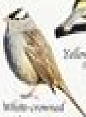
White-crowned Sparrow Zonotrichia leucophrys