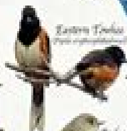
Eastern Towhee Pipilo erythrophthalmus