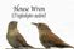
House Wren Troglodytes aedon