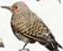
Northern Flicker Colaptes auratus