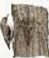
Brown Creeper Certhia americana