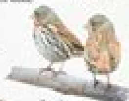
Fox Sparrow Passerella iliaca