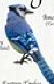
Blue Jay Cyanura cristata