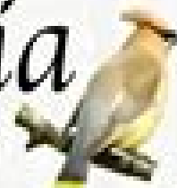
Cedar Waxwing Myiurus cinerea