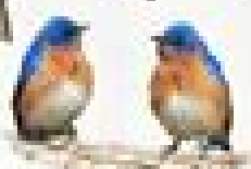
Eastern Bluebird Sialia sialis