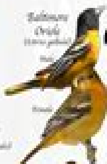
Baltimore Oriole Icterus galbula