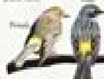
Yellow-rumped Warbler Geothlypis trichas