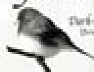
Dark-eyed Junco Junco hyemalis