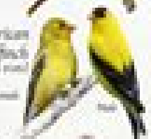
American Goldfinch Spinus tristis