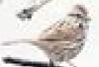
Song Sparrow Melospiza melodia