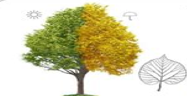
Small leaved Lime