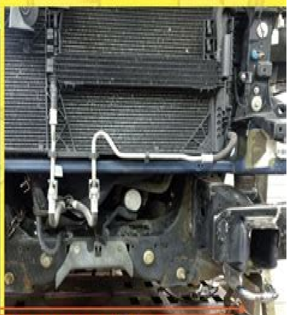
Ford F-150 before & after