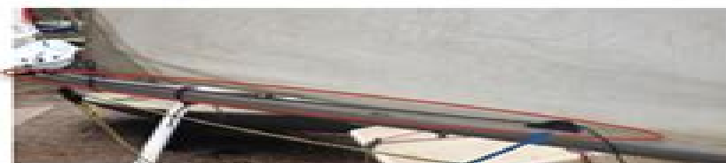
Clew outhaul back to cleat on boom