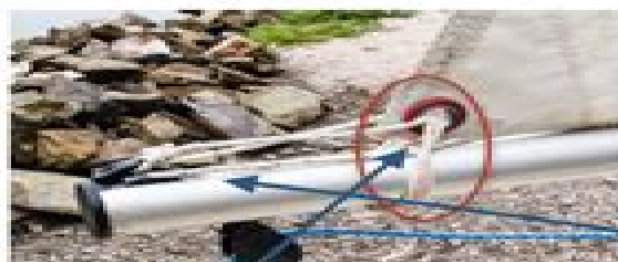
Tie clew to boom