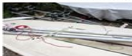
Mast in two sections: