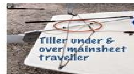
Tiller under & over mainsheet traveller