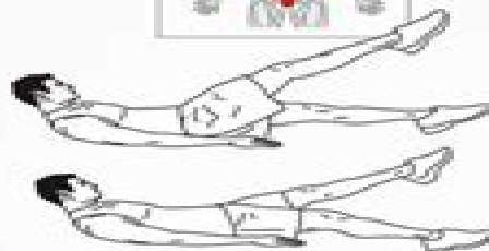
2. flutter kicks