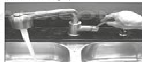
Figure 9 - Let the hot water run until it is cool.

Open a hot water faucet and let the hot water run until it is cool (This may take 10 minutes or longer).