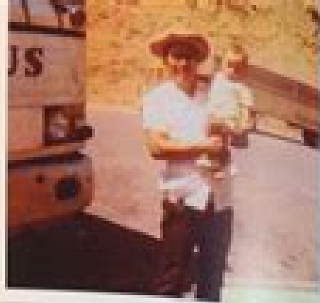
The girl and milk - Oaxaca