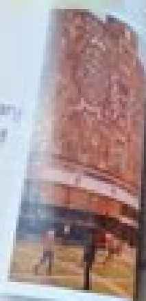
Mosco Library - Mexico City University