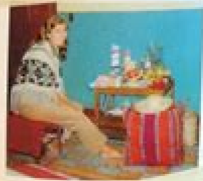
The girl who milk - Oaxaca