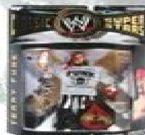
WWE Classic Toy Fair Terry Funk $300