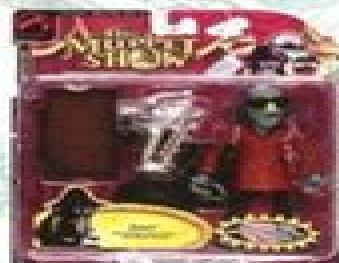
The Muppet Show Zoot (Chase) $100