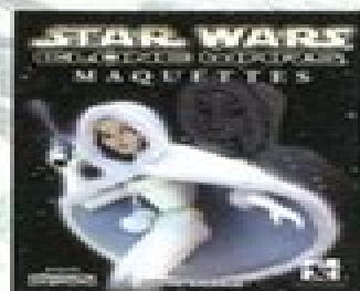
Gentle Giant Star Wars Amidala Maquette $500