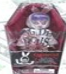
Living Dead Dolls Bloody Eggzorcist $650