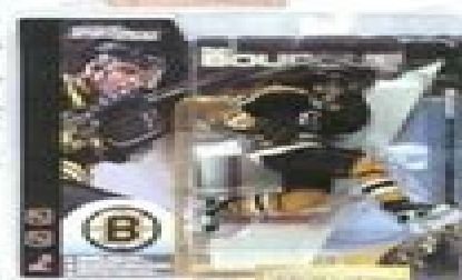
Boston Bruins Ray Bourque $350