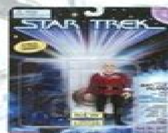
Star Trek Tapestry Picard $250