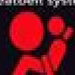
Airbag and seatbelt system