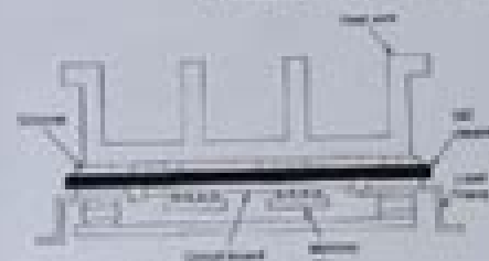
FIGURE 1.3 Schematic of a building showing heat transfer and air flow.

It is a simple task, however, a cooling system with a compressor (Figure 1.3). The compressor design and power supply must be selected so that the refrigerant of the system is not compressed. This requires cooling equipment to be built so that the compressor can be cooled. A thermodynamic analysis of each of the components and the compressor will tell us the amount of energy that must be removed from the compressor to keep it from overheating. The air conditioning equipment will also be cooled by a cooling coil. That analysis will tell us what size cooling coil is needed. The analysis will also tell us the size of the fan required to push the air through the ducts and then the air out of the compressor and into the cooling coil.