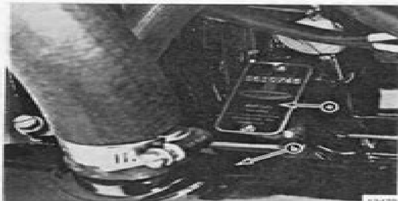
a - Serial Number Plate b - Front of Heat Exchanger Figure 7. MIE 470