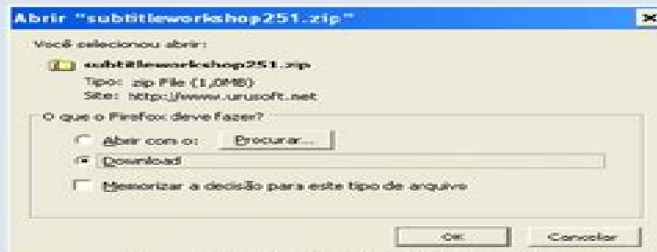
Figura 1. Download Subtitle Workshop 2.51

mirror 1 . Será exibida a seguinte janela.