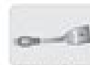
USB Host Cable