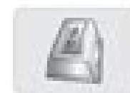
Cradle (H40 option)