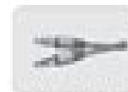
Line In/Out Cable