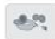
Earphones and Earphone covers