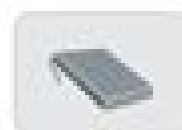
User's guide (including Product Warranty Card), Quick start guide