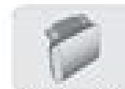
External Battery Pack