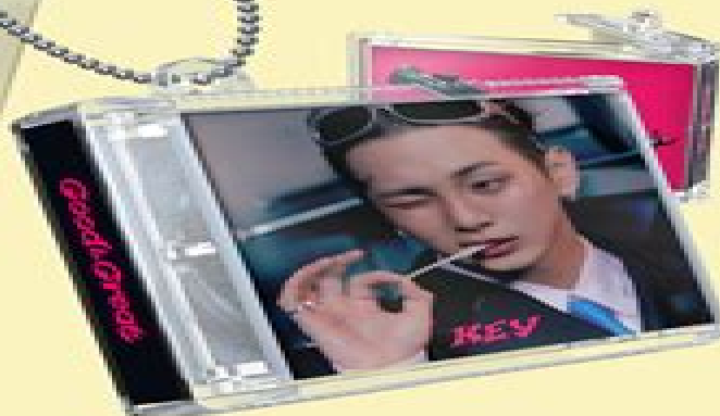
SMini Case & Ball Chain