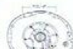
Chrysler TH-727 & 904, 373, 318, 340, 360