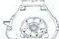
Ford TA, 429, 460, 251-6, 428-6