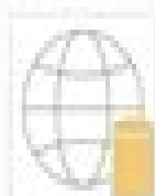
Custom web app

Suggested searches: Assets Business Contacts Employees Inventory Project Sales