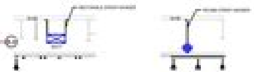
REGULATIONS ON THE HANCOCK DISTRICT