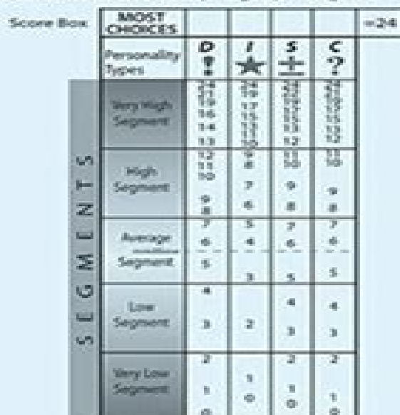
Graph I - Environment Style (How People See You)