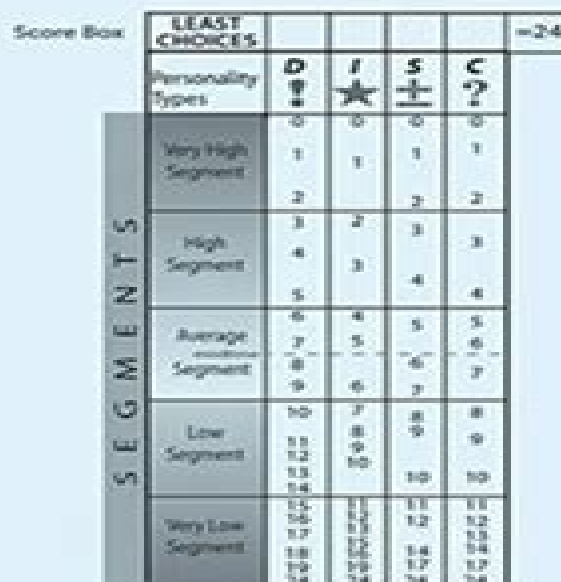
Graph II - Basic Style (The Real You)