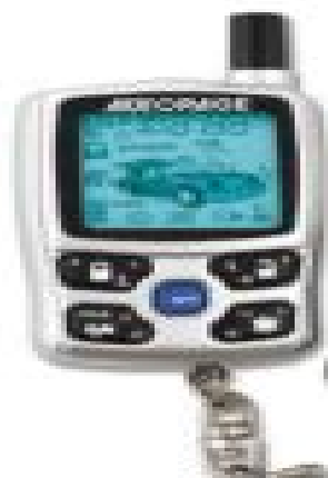
Model: XT-720LCD RS-720LCD, RS-520LCD