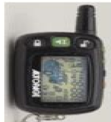
Model: XT-75LCD RS-750LCD