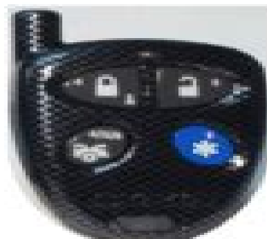
Model: XT855 RS-850LCD