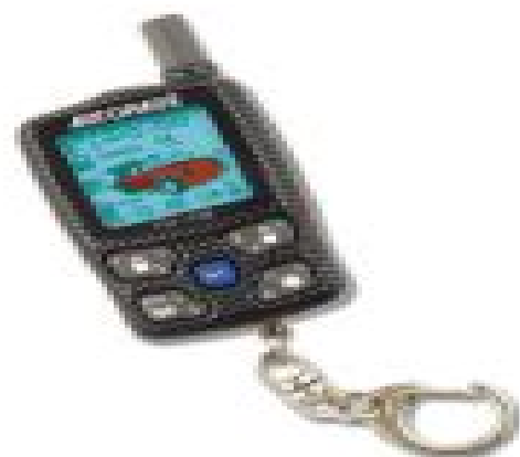
Model: XT-855LCD RS-855LCD