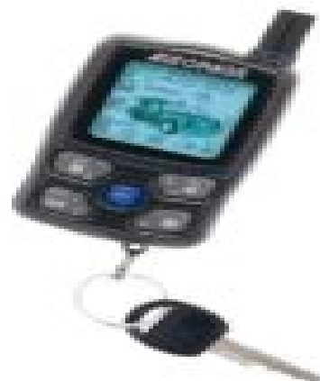
Model: XT-85LCD RS-850LCD