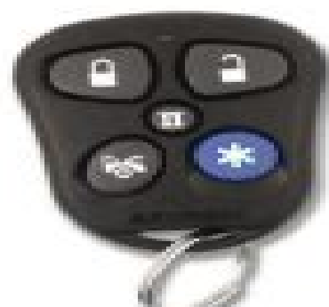
Model: XT-725 RS-720LCD, RS-520LCD, RS-655, RS-615