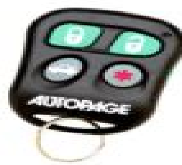
Model: XT-60 RS-650 Plus, RS610 Plus, RS-610, RS650